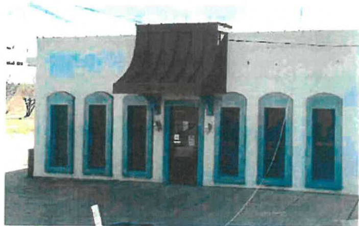
Current appearance, above