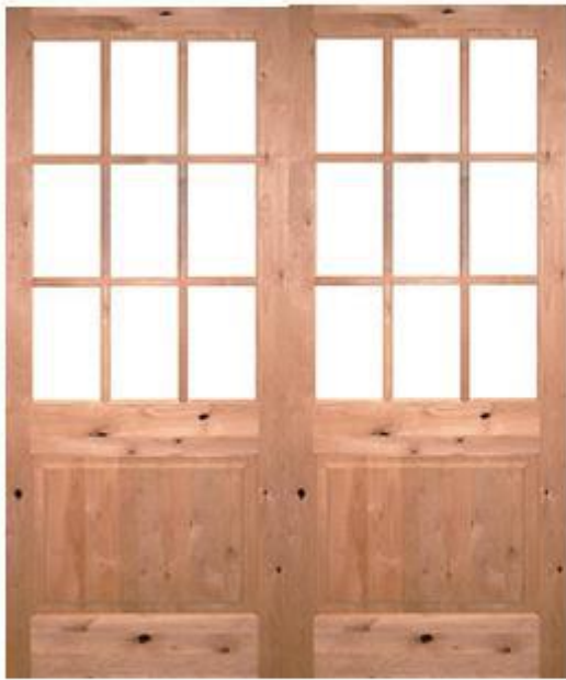
Front Doors – stained wood